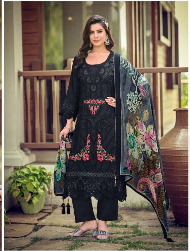
A timeless wardrobe