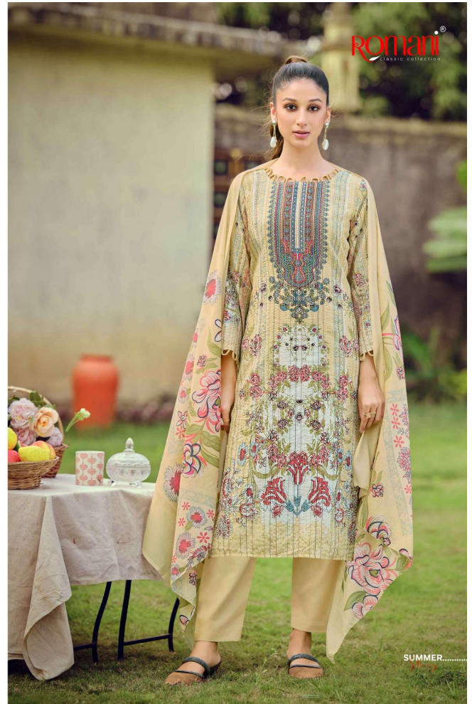
1136-005 If you're stressing it's on your mind, have some inspiration, you ***