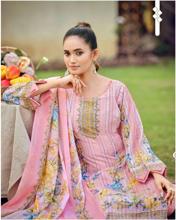
These are the garment thou can kill *** 1136-003