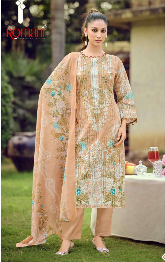
This season is giving be bright & colorful *** 1136-001