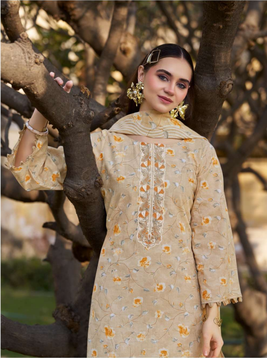
"Don't be into trends. Don't make fashion own you, but you decide what you are, what you want to express by the way you dress and the way to live."