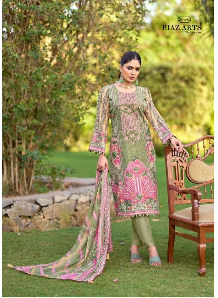
Elegant philosophy ~~~~~ • 1005 •

Celebrate each moment with sparkle and shine.