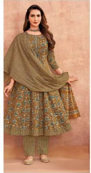
D No. 1114