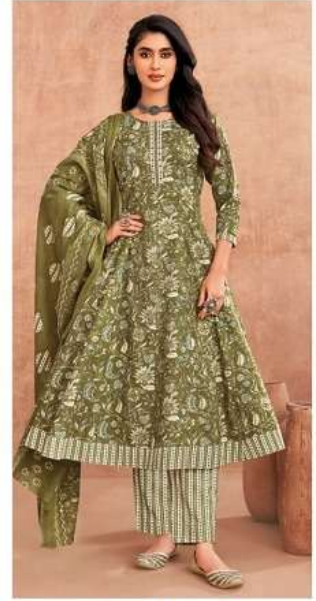
D No. 1110