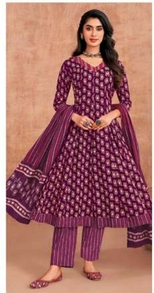
D No. 1116