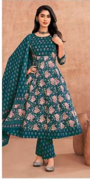
D No. 1108