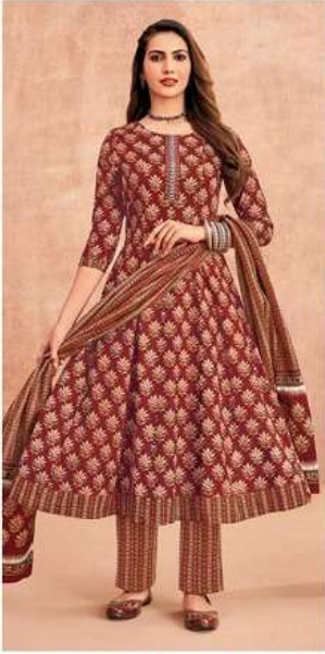
D No. 1107