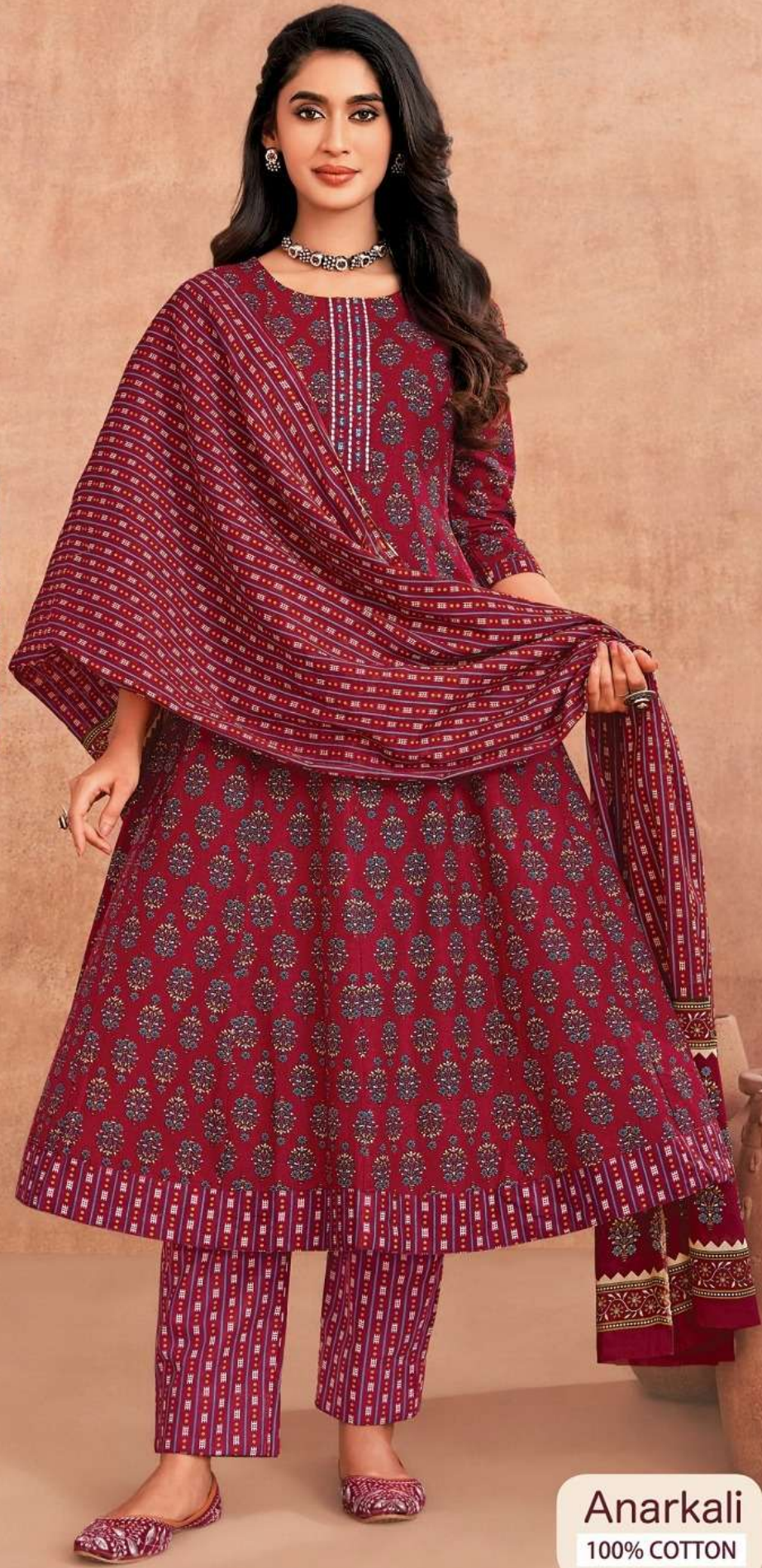
Anarkali 100% COTTON