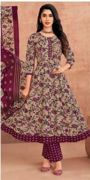
D No. 1115