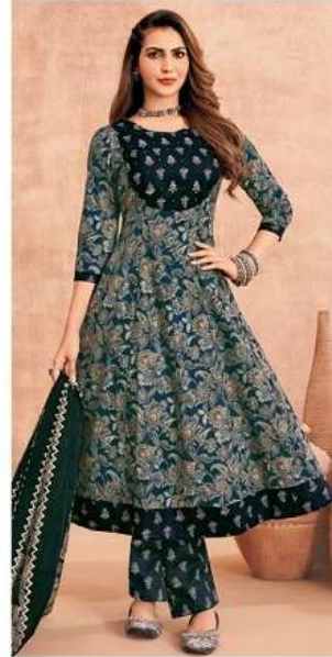
D No. 1113