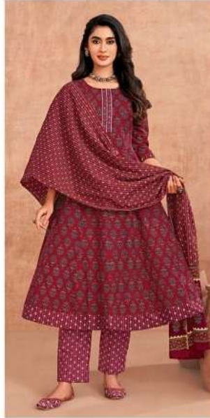
D No. 1112