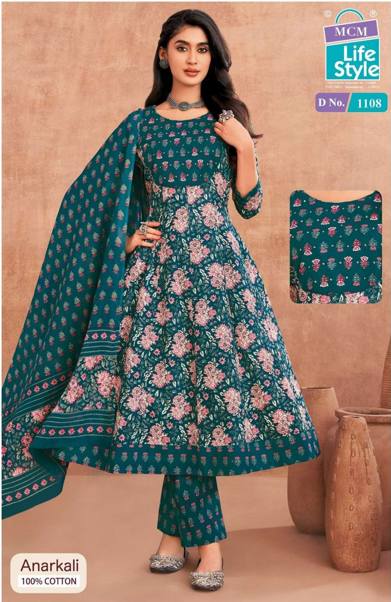
Anarkali 100% COTTON