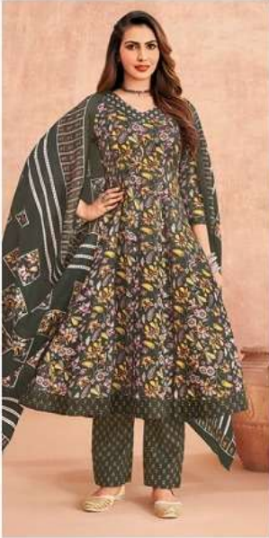
D No. 1111