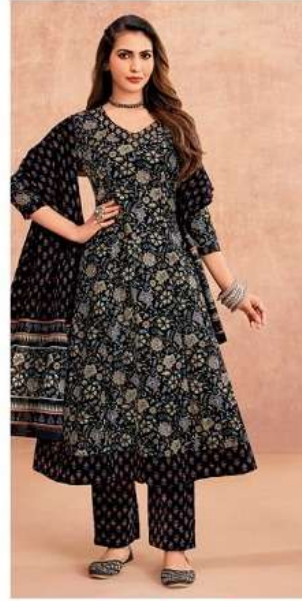
D No. 1109