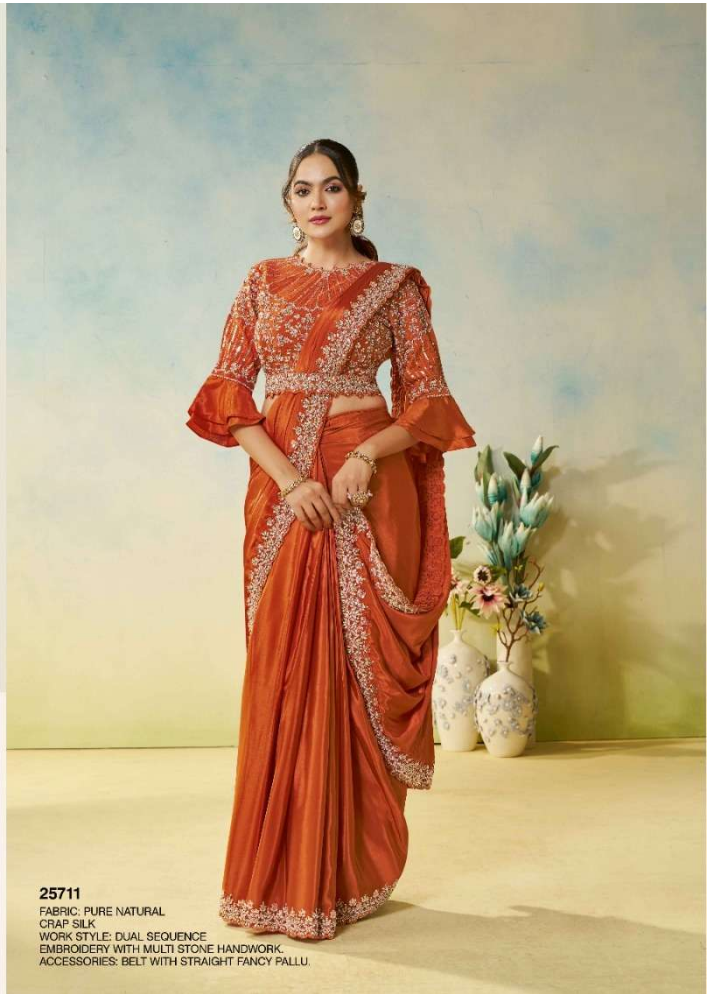
25711 FABRIC: PURE NATURAL CRAP SILK WORK STYLE: DUAL SEQUENCE EMBROIDERY WITH MULTI STONE HANDWORK, ACCESSORIES: BELT WITH STRAIGHT FANCY FALLU.