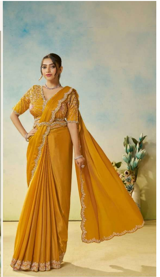
25702 FABRIC: SOFT SATIN SILK WORK STYLE: DUAL SEQUENCE EMBROIDERY WITH MULTI STONE HANDWORK. ACCESSORIES: BELT WITH FANCY PALLU.