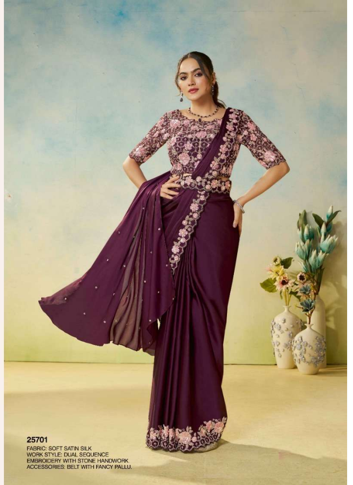
25701 FABRIC: SOFT SATIN SILK WORK STYLE: DUAL SEQUENCE EMBROIDERY WITH STONE HANDWORK ACCESSORIES: BELT WITH FANCY PALLU.