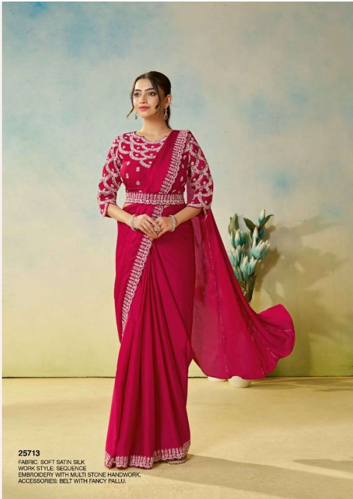
25713 FABRIC: SOFT SATIN SILK WORK STYLE: SEQUENCE EMBROIDERY WITH MULTI STONE HANDWORK. ACCESSORIES: BELT WITH FANCY PALLU.