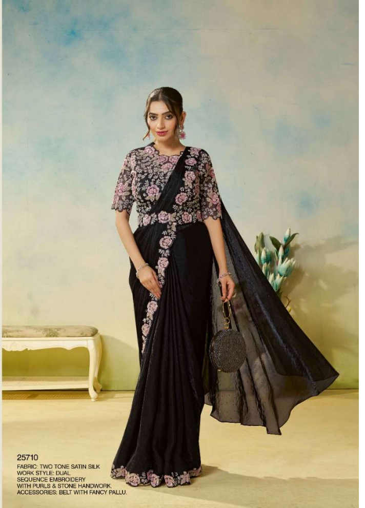
25710 FABRIC: TWO TONE SATIN SILK WORK STYLE: DUAL SEQUENCE EMBROIDERY WITH PURLS & STONE HANDWORK. ACCESSORIES: BELT WITH FANCY PALLU.