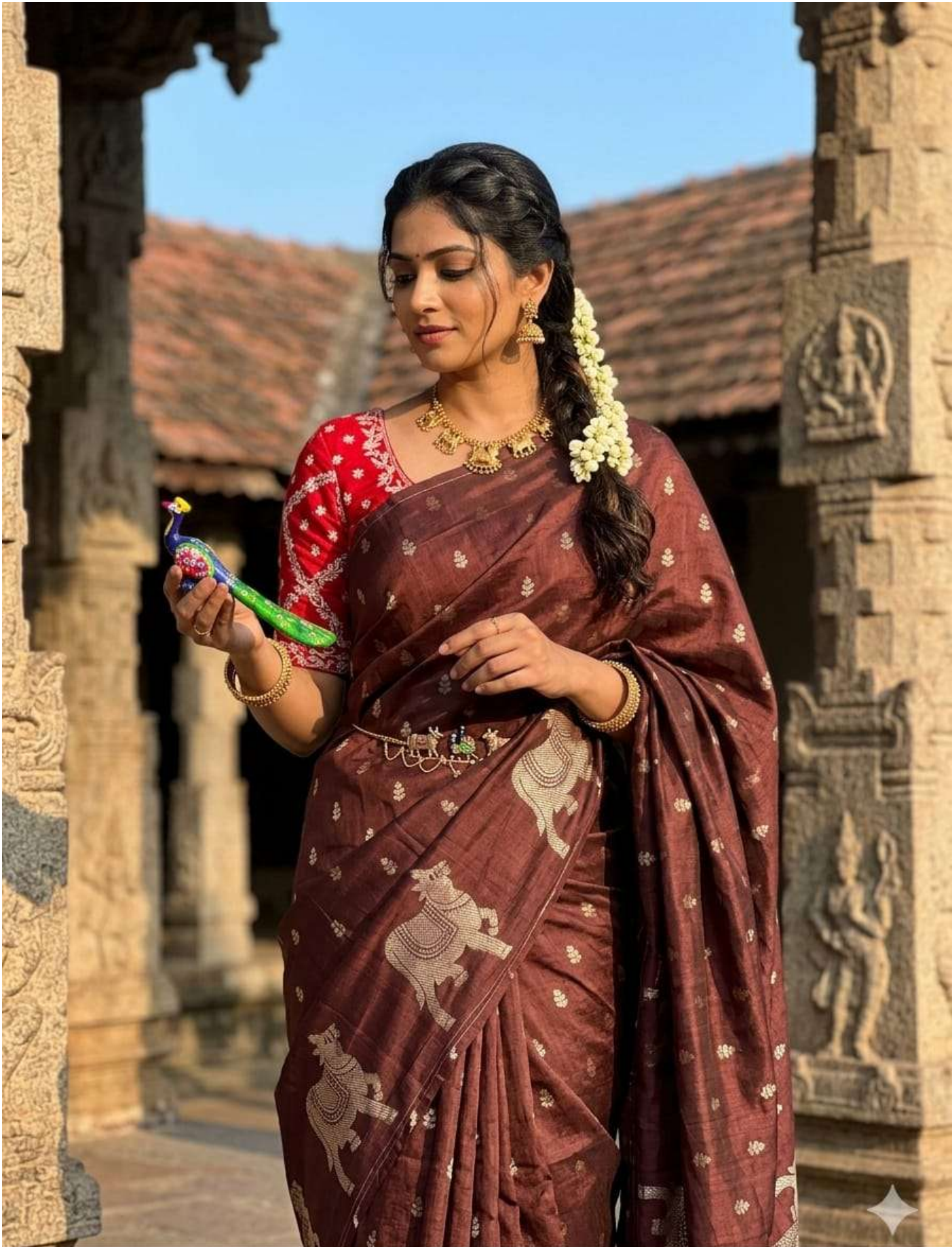
Saree: Maroon Nandi Silk, Blouse: Embroidered Red. #SilkSareeStyle #SouthIndianTradition