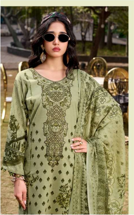
Clean edges with regal intention luxury whispers through fine textures every detail is placed with purpose designed for those who value refined taste.