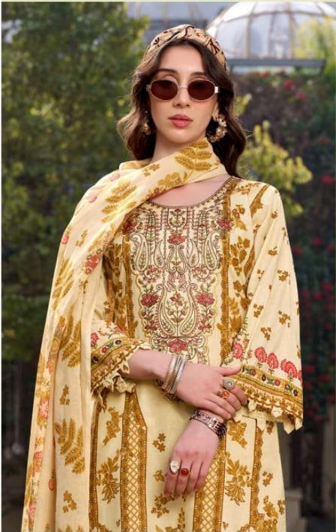
Grandeur without weight dramatic silhouette with gentle balance bold lines soft finishes a garment that commands attention quietly royalty without effort.