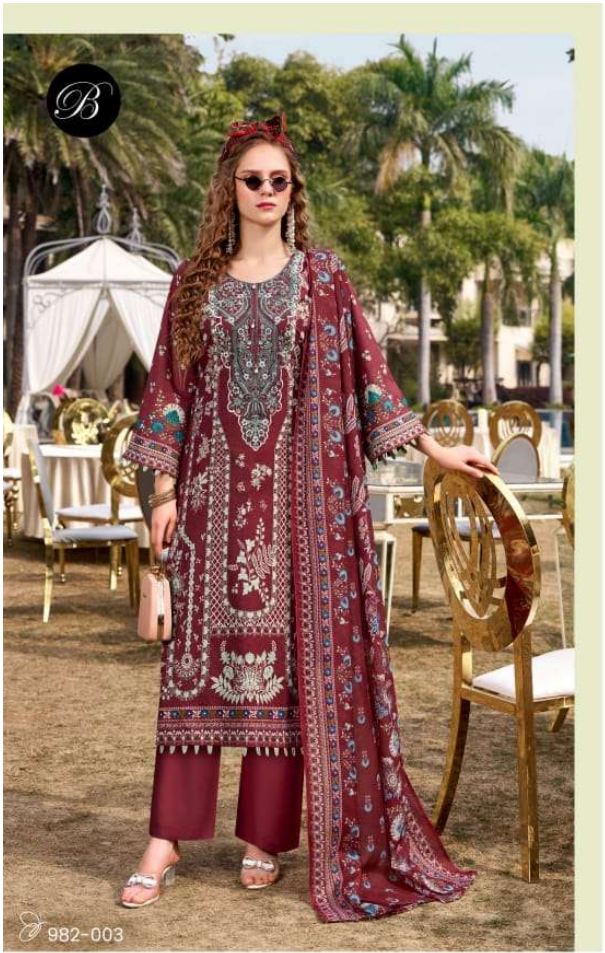
Modern lines polished with subtle sophistication every thread reflects the spirit of the city balanced shapes designed for movement and comfort.