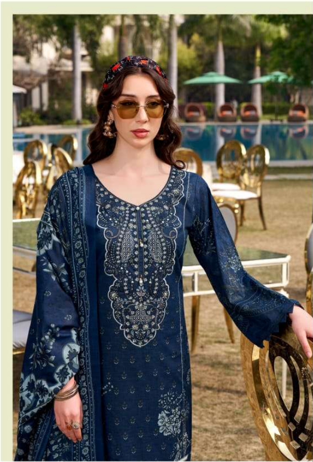
A silhouette born from tradition and elevated for today soft textures create a gentle rhythm with every move crafted to suit quiet moments and bold entrances alike.