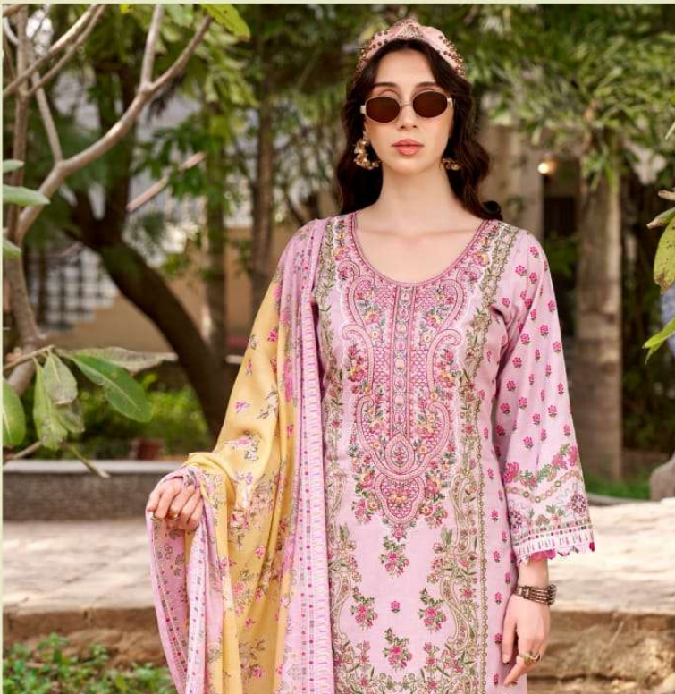
Comfort meets couture in perfect harmony lightweight materials shaped for daily wear uncomplicated design with lasting appeal from morning meetings to evening dinners.