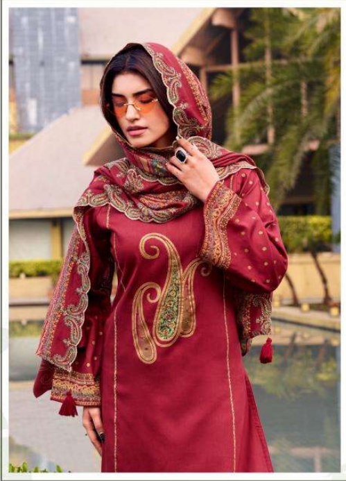
1001 | Elegance begins in the weave...

ممتاز آرٹس MUMTAZ ARTS® Rajyon ki Rang व्राजकला