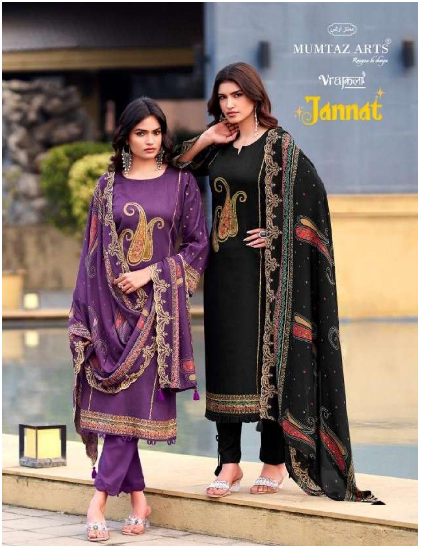
(JAM SATIN DISCHARGE PRINT HANDWORK TO MUSLIN DUP EMB)