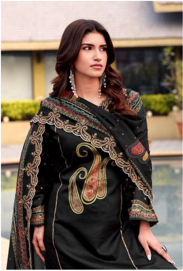
1002 | Designed for prescneec, not noise...