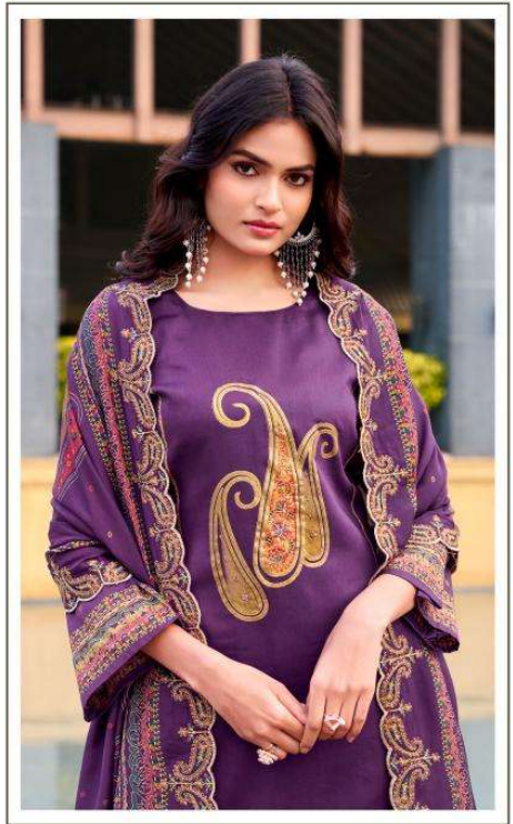
1003 | A silhouette shaped by heritage...

ممتاز آرٹس MUMTAZ ARTS® Rangya ki Rangya Vrajkala