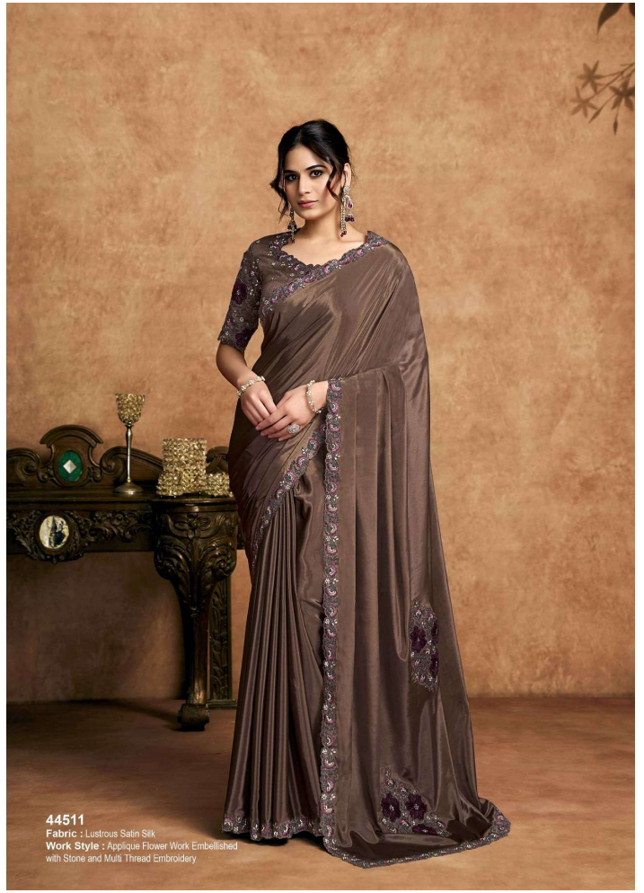
44511 Fabric : Lustrous Satin Silk Work Style : Applique Flower Work Embellished with Stone and Multi Thread Embroidery