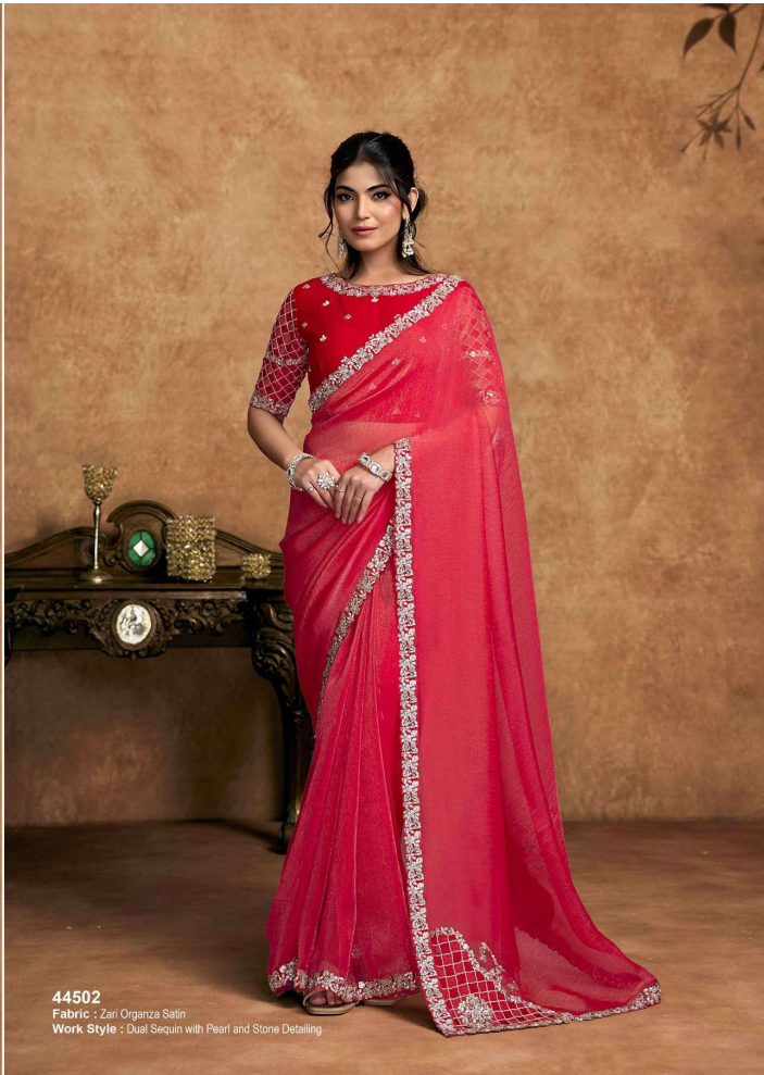
44502 Fabric : Zari Organza Satin Work Style : Dual Sequin with Pearl and Stone Detailing