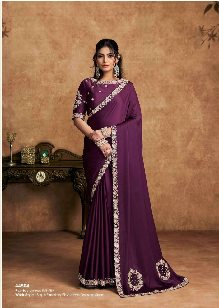
44504 Fabric : Lustrous Satin Silk Work Style : Sequin Embroidery Elevated with Pearls and Stones