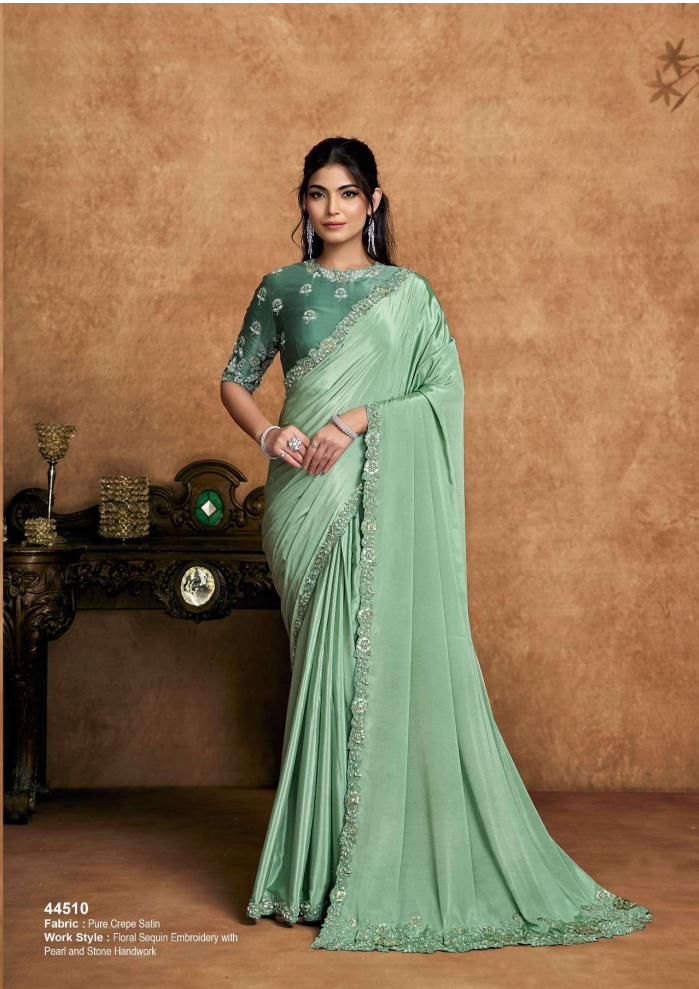
44510 Fabric : Pure Crepe Satin Work Style : Floral Sequin Embroidery with Pearl and Stone Handwork