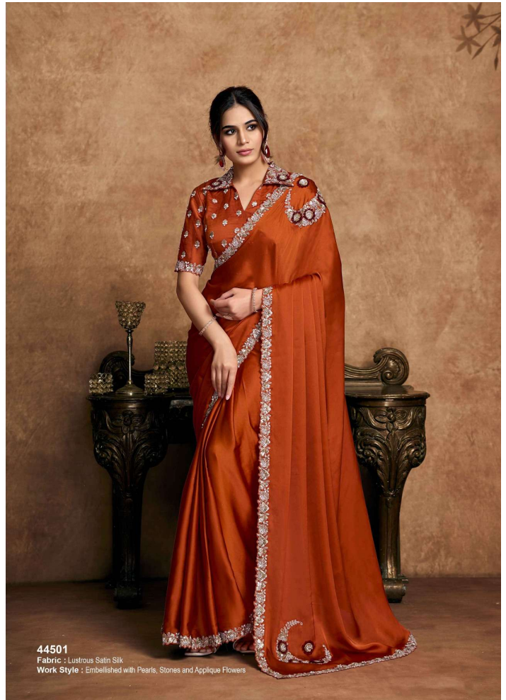
44501 Fabric : Lustrous Satin Silk Work Style : Embellished with Pearls, Stones and Applique Flowers