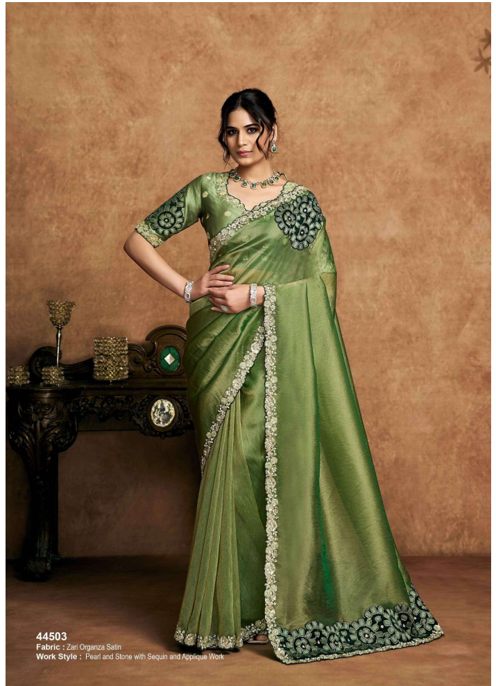
44503 Fabric : Zari Organza Satin Work Style : Pearl and Stone with Sequin and Applique Work