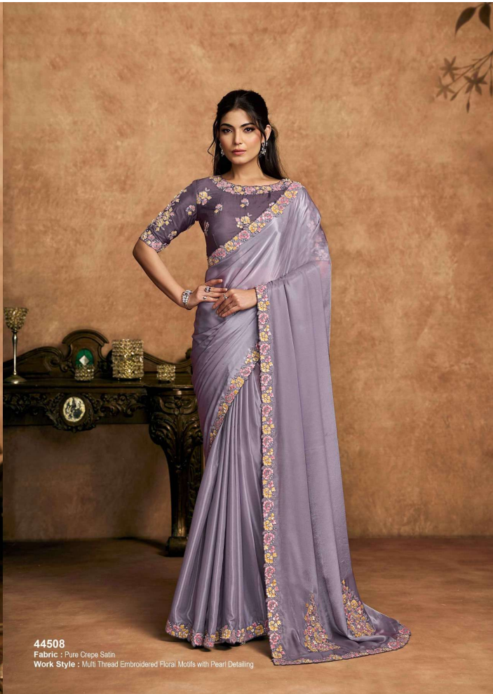
44508 Fabric : Pure Crepe Satin Work Style : Multi Thread Embroidered Floral Motifs with Pearl Detailing