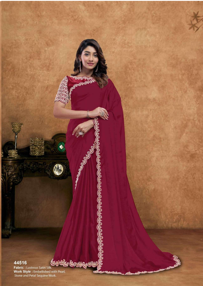
44516 Fabric : Lustrous Satin Silk Work Style : Embellished with Pearl, Stone and Petal Sequine Work.