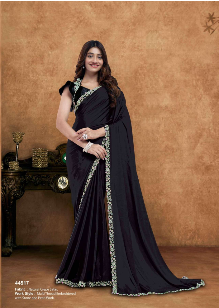
44517 Fabric : Natural Crepe Satin. Work Style : Multi Thread Embroidered with Stone and Pearl Work.