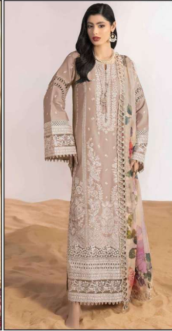
D NO 1003