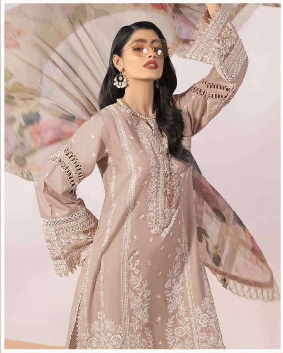
CRIMSON LUXURY LAWN COLLECTION VOL-1 1003