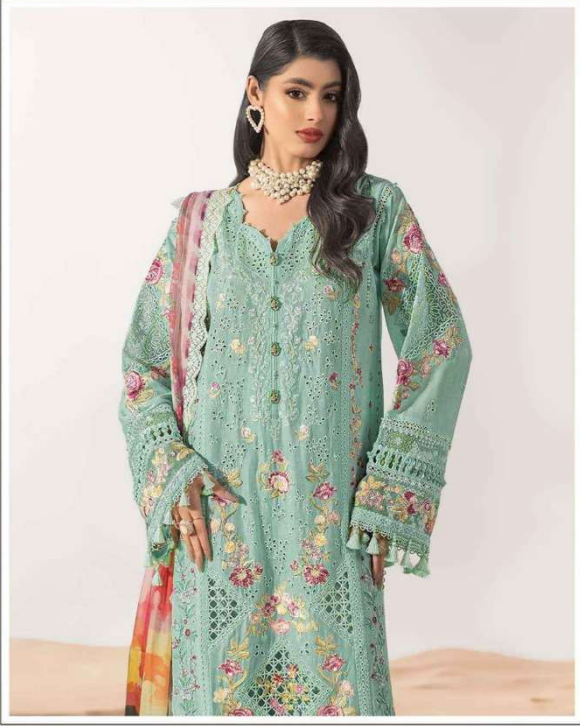
CRIMSON LUXURY LAWN COLLECTION VOL-1 1001