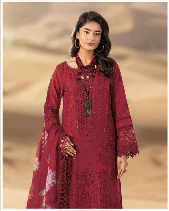
CRIMSON LUXURY LAWN COLLECTION VOL-1 1002