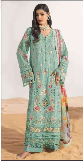
D NO 1001