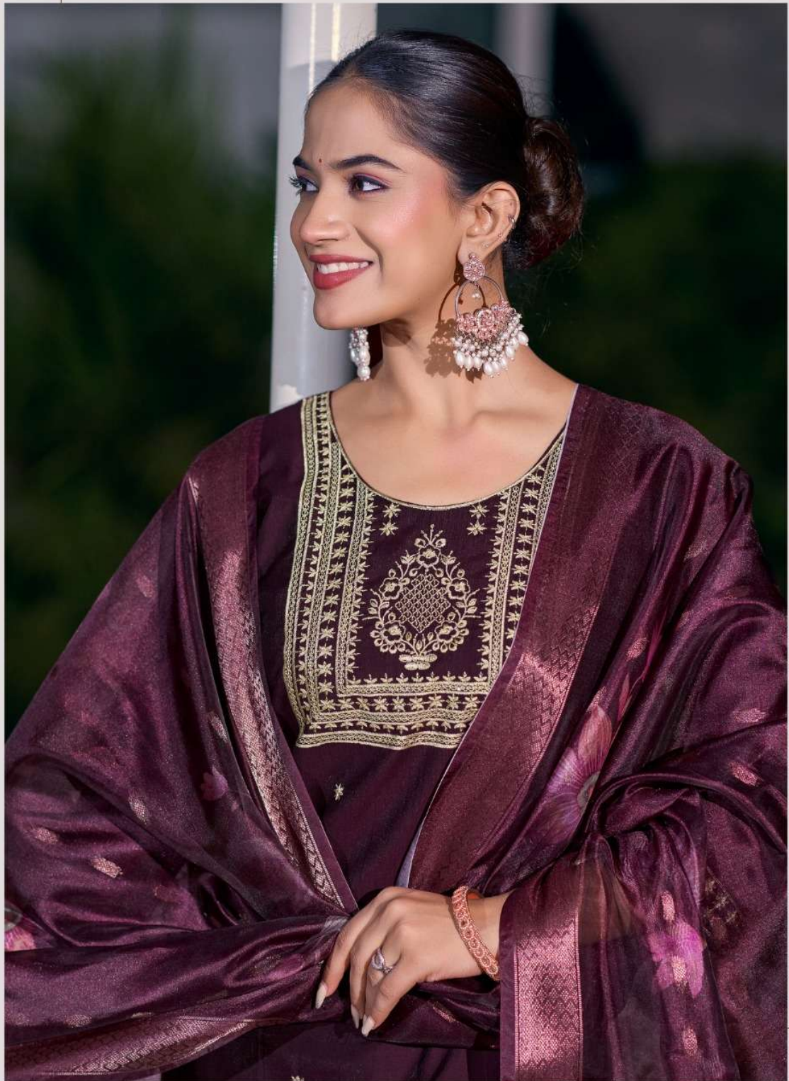
THE SHALWAR KAMEEZ, ORIGINATING FROM CENTRAL ASIA, HAS EVOLVED TO REFLECT SOUTH ASIAN CULTURAL DIVERSITY, COMBINING TRADITIONAL AND MODERN ELEMENTS IN CONTEMPORARY FASHION.