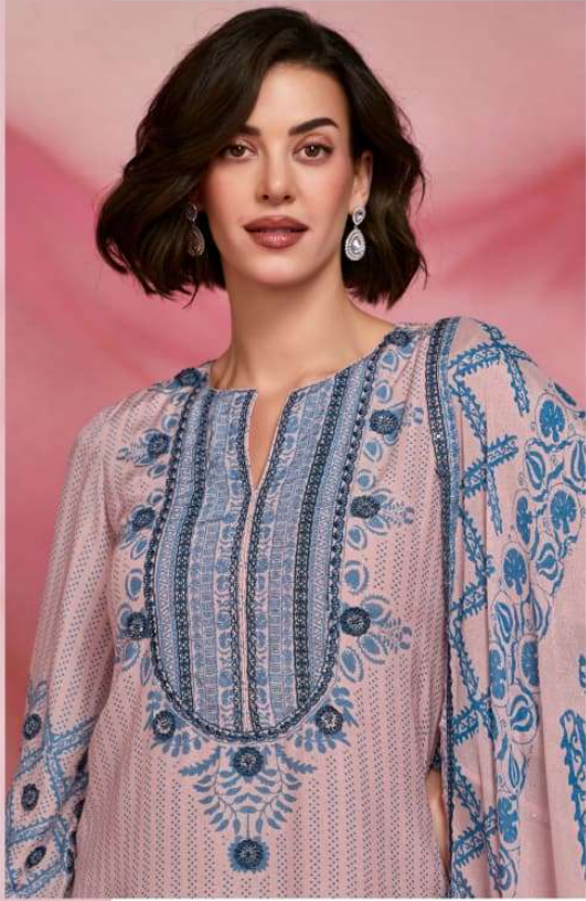
H-0064 Chend Tare a blend of celestial beauty and summer ease.