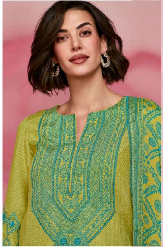
Chand Taw inspired elegance woven into effortless summer silhouettes. H-0065