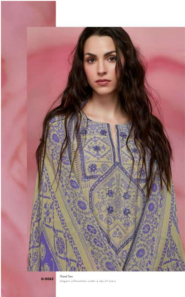
H-0063 Chandi Tare elegant silhouettes under a sky of stars.