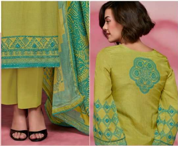
Chand Tare moonlit elegance woven into effortless summer silhouettes.