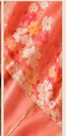
Digital Print Dupatta