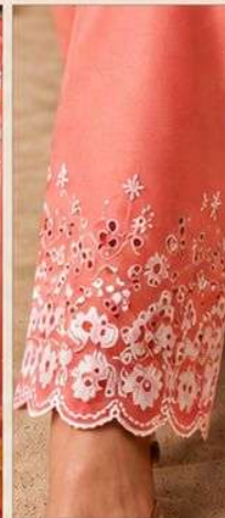
Fancy Embroidery Work