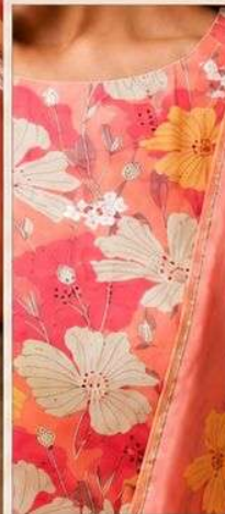
Digital Print with Embroidery