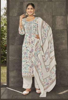
3685 B ❖