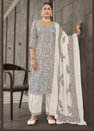
3686 B ❖