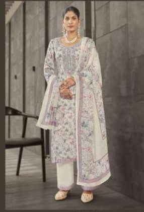
3688 A ❖