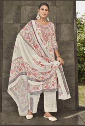
3687 A ❖