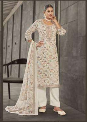
3688 B ❖