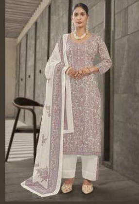
3686 A ❖