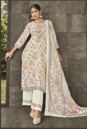
3687 B ❖