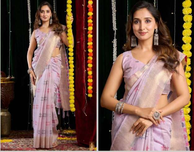
sarees goals: Midnight blues and starry skies