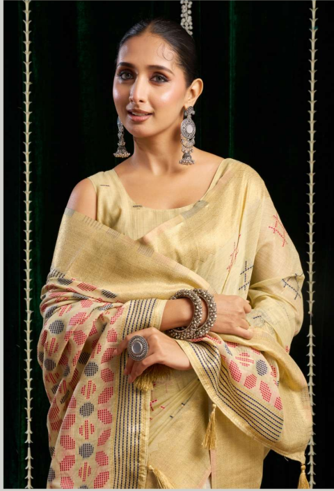
Twirling into the limelight like the queen I am