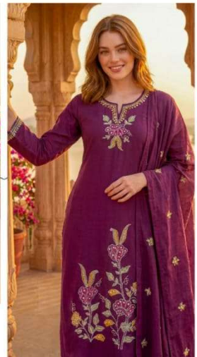
ROYAL WINE GRACE

Rich wine tones blended with delicate floral embroidery create a look of pure elegance. Designed for women who love subtle luxury and timeless style. Perfect for festive celebrations and evening occasions.