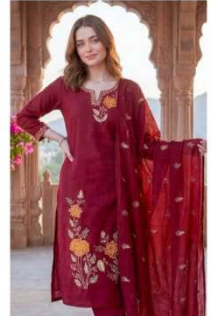
FESTIVE RED RADIANCE

Celebrate every occasion in this stunning red embroidered suit. The intricate golden detailing adds a touch of traditional opulence, making it ideal for weddings and festive moments. Bold, beautiful, and unforgettable.