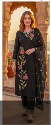
MIDNIGHT BLOOM ELEGANCE

Step into timeless sophistication with this black floral embroidered suit. The vibrant embroidery adds a graceful charm, perfect for festive evenings and special gatherings. A classic statement that never goes out of style.