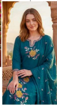
TEAL HERITAGE GLOW

Inspired by timeless craftsmanship, this teal suit blends elegance with modern charm. The detailed embroidery adds a touch of drama, making it a perfect choice for festive days and special gatherings.