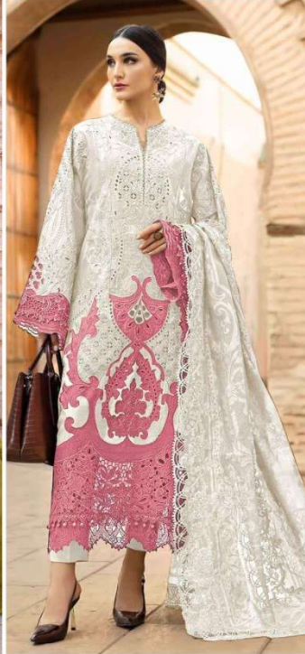
7183 - F