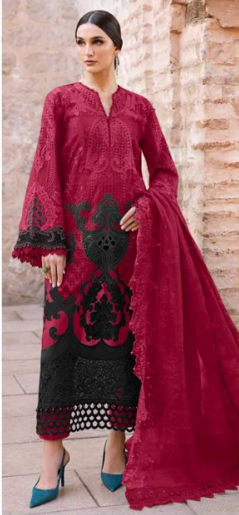
7183 - A

TOP:- COTTON WITH HEAVY EMBROIDERY CHIKANKARI WORK BOTTOM:- COTTON DUPATTA:- COTTAN PRINT WITH WORK