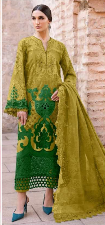
7183 - D