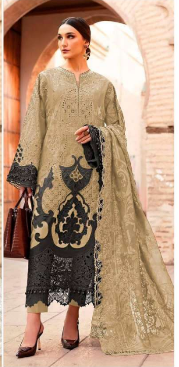
7183 - G