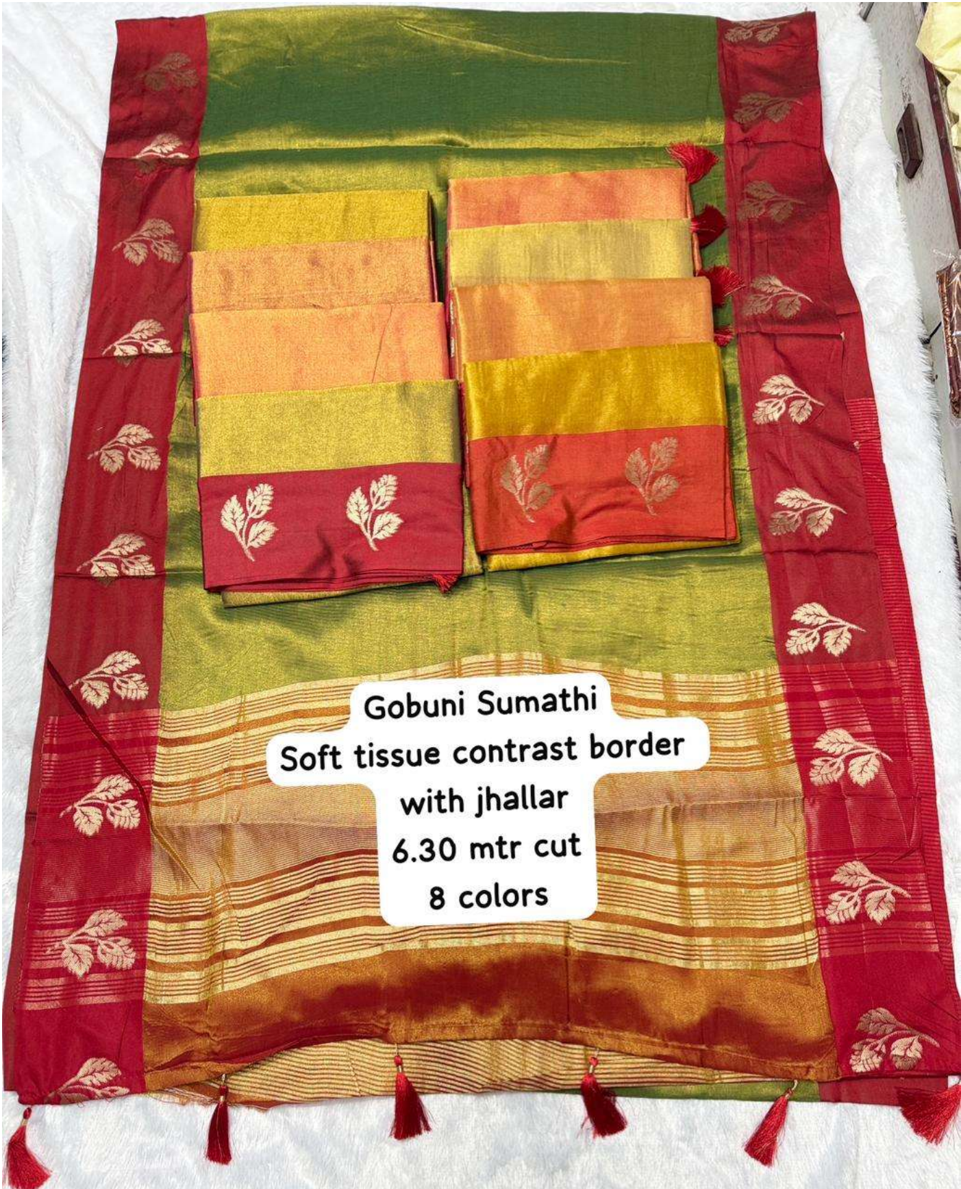
Gobuni Sumathi Soft tissue contrast border with jhallar 6.30 mtr cut 8 colors