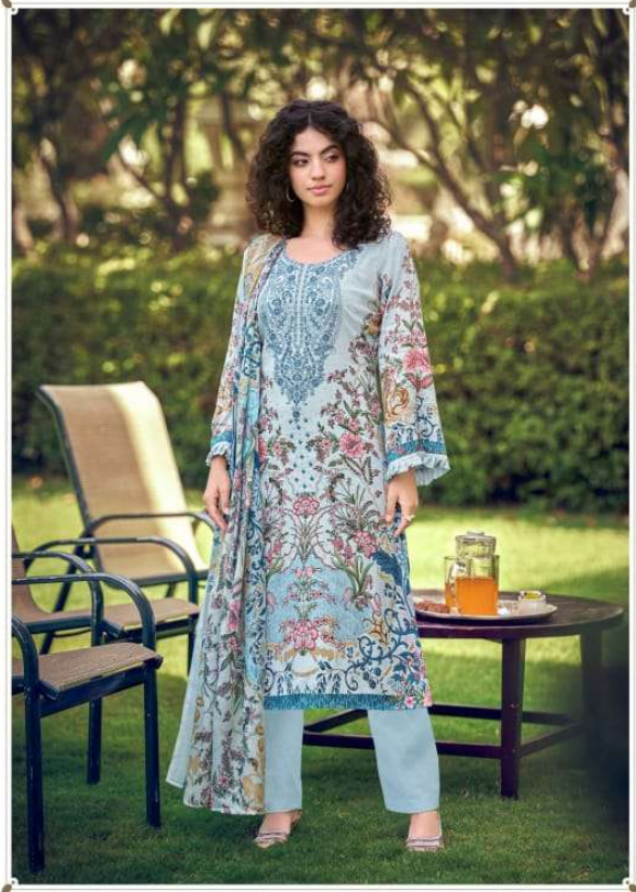
Gorgeous ethnic attire that Sows Attention Around by this Label, be a stylist with Bellini.